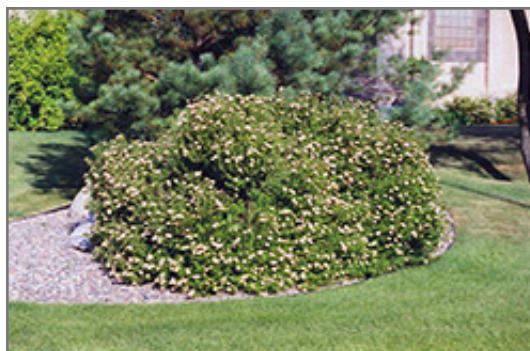
Pink Beauty Potentilla in bloom