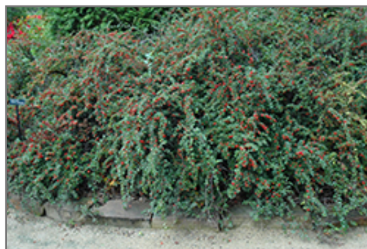
Cranberry Cotoneaster