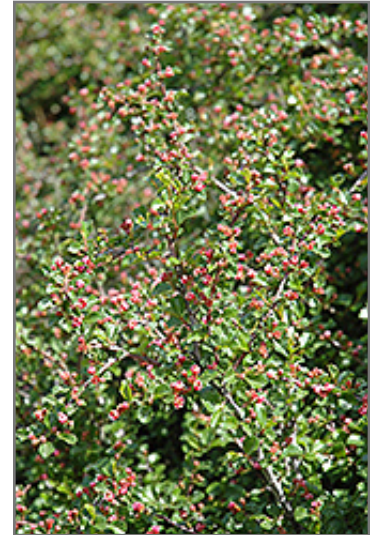
Cranberry Cotoneaster flowers

This shrub does best in full sun to partial shade. It is very adaptable to both dry and moist growing conditions, but will not tolerate any standing water. It is not particular as to soil type or pH, and is able to handle environmental salt. It is highly tolerant of urban pollution and will even thrive in inner city environments. This species is not originally from North America.