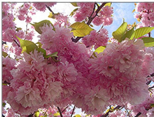
Kwanzan Flowering Cherry flowers