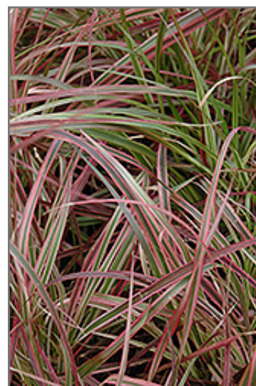
Fireworks Fountain Grass foliage