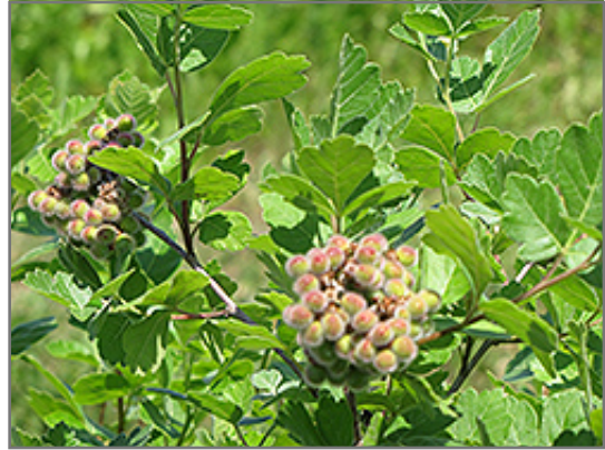
Gro-Low Fragrant Sumac fruit

This shrub performs well in both full sun and full shade. It is very adaptable to both dry and moist locations, and should do just fine under typical garden conditions. It is not particular as to soil type, but has a definite preference for acidic soils, and is subject to chlorosis (yellowing) of the leaves in alkaline soils. It is highly tolerant of urban pollution and will even thrive in inner city environments. Consider applying a thick mulch around the root zone in winter to protect it in exposed locations or colder microclimates. This is a selection of a native North American species.