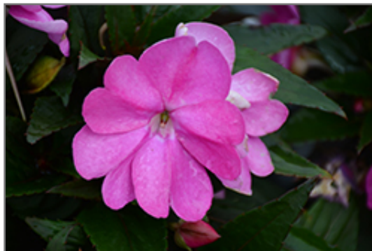
SunPatiens Compact Lilac New Guinea Impatiens flowers