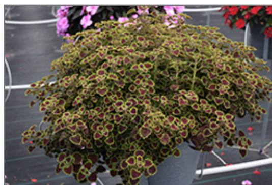
Burgundy Wedding Train Coleus