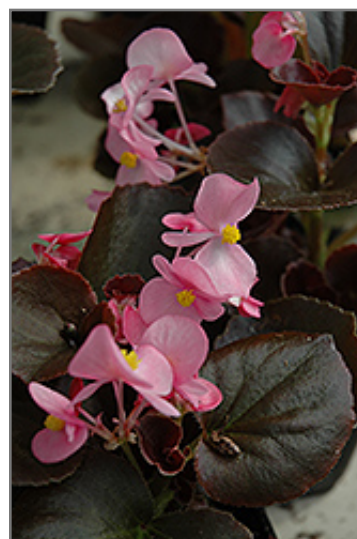
Cocktail Gin Begonia flowers