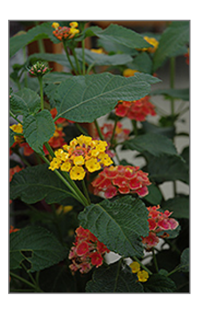
Confetti Lantana flowers