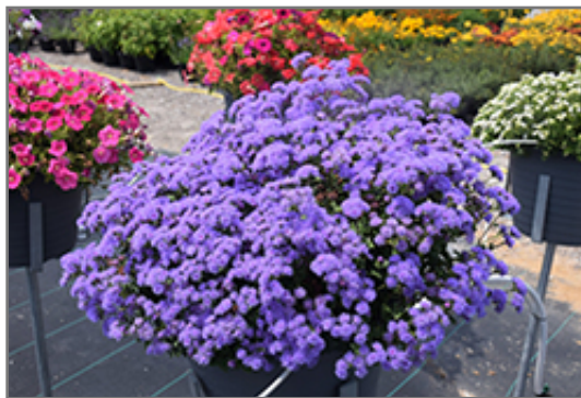
Artist Blue Flossflower in bloom