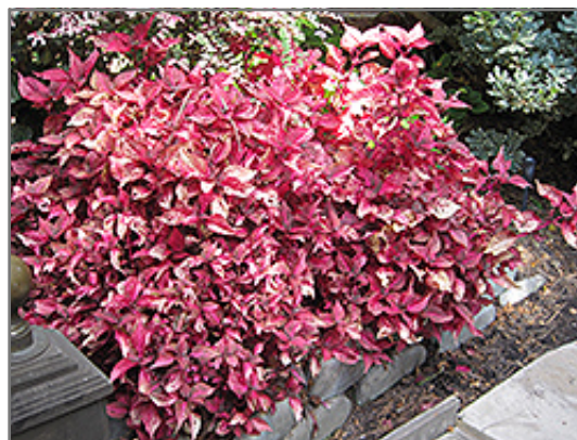
Blood Leaf