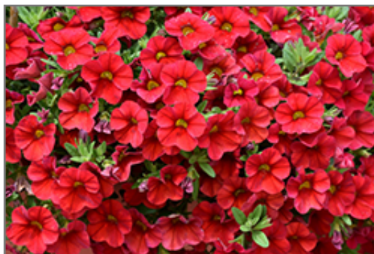
Superbells Red Calibrachoa flowers

Superbells Red Calibrachoa is recommended for the following landscape applications;