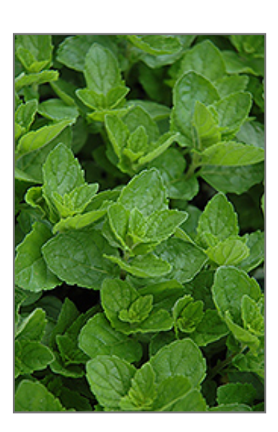
Spearmint foliage