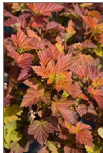
Amber Jubilee Ninebark foliage

This shrub will require occasional maintenance and upkeep, and can be pruned at anytime. It has no significant negative characteristics.