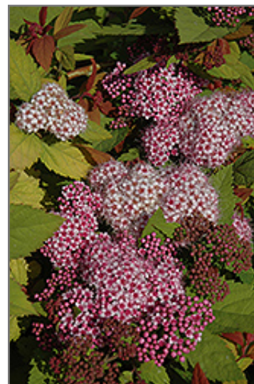
Double Play Big Bang Spirea flowers

Double Play Big Bang Spirea is recommended for the following landscape applications;