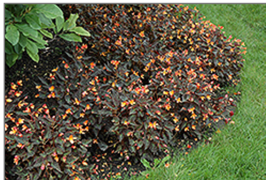
Sparks Will Fly Begonia in bloom