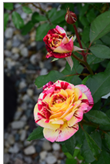
George Burns Rose flowers

George Burns Rose is recommended for the following landscape applications;