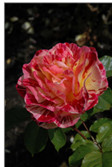
George Burns Rose flowers