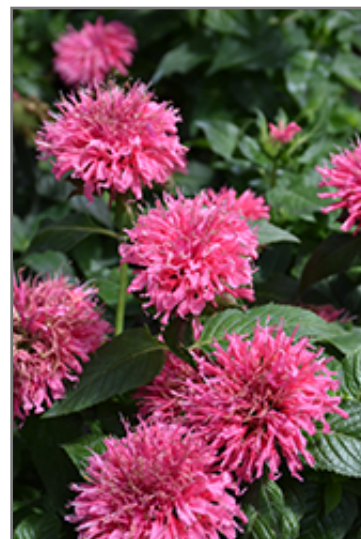
Bubblegum Blast Beebalm flowers