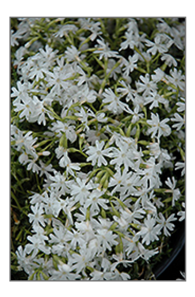
Snowflake Phlox flowers

This variety produces a showy carpet of bright white flowers shining in the spring sun; prune lightly after flowering to encourage a dense growth habit; wonderful for rock gardens, edging, or in mixed containers