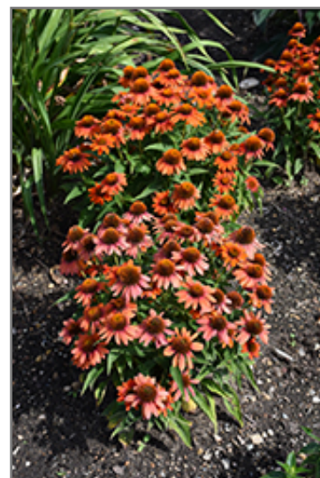
Sombbrero Adobe Orange Coneflower in bloom