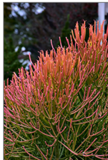
Sticks On Fire Red Pencil Tree foliage

Sticks On Fire Red Pencil Tree is recommended for the following landscape applications;