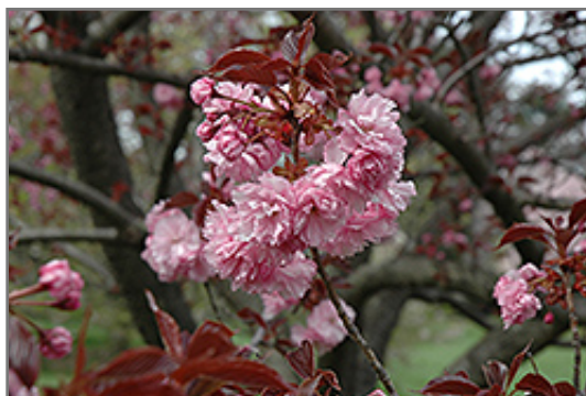
Royal Burgundy Flowering Cherry flowers