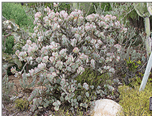
Silver Dollar Plant

Silver Dollar Plant is recommended for the following landscape applications;