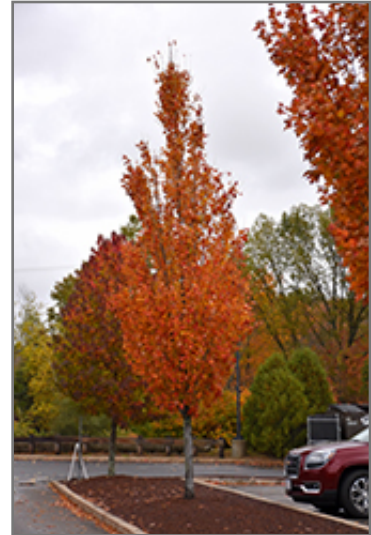
Armstrong Gold Red Maple in fall

This tree does best in full sun to partial shade. It does best in average to evenly moist conditions, but will not tolerate standing water. It is not particular as to soil type or pH. It is somewhat tolerant of urban pollution. This is a selection of a native North American species.