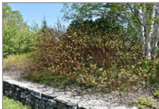
Bailey's Red Twig Dogwood in spring