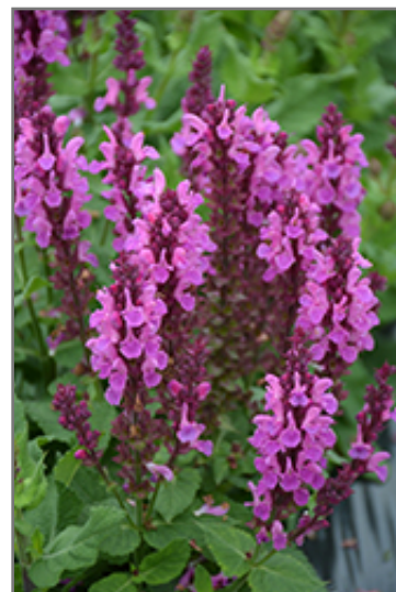
Rose Marvel Meadow Sage flowers

Rose Marvel Meadow Sage is recommended for the following landscape applications;