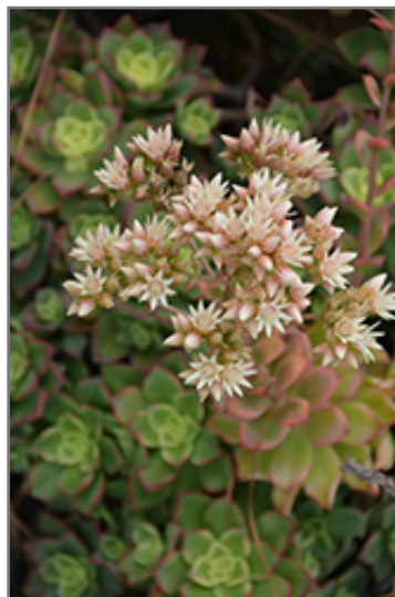
Kiwi Aeonium flowers