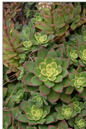
Kiwi Aeonium foliage

Kiwi Aeonium is a fine choice for the garden, but it is also a good selection for planting in outdoor pots and containers. Because of its spreading habit of growth, it is ideally suited for use as a 'spiller' in the 'spiller-thriller-filler' container combination; plant it near the edges where it can spill gracefully over the pot. Note that when growing plants in outdoor containers and baskets, they may require more frequent waterings than they would in the yard or garden.