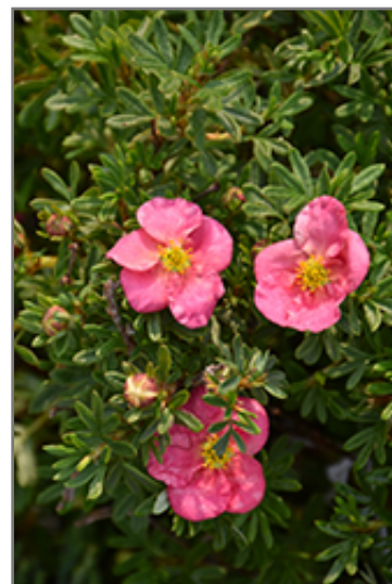
Bella Bellissima Potentilla flowers