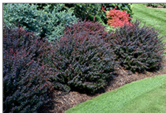
Sunjoy Mini Maroon Japanese Barberry

Sunjoy Mini Maroon Japanese Barberry is recommended for the following landscape applications;