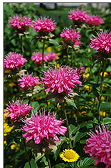
Marshall's Delight Beebalm flowers

Marshall's Delight Beebalm is recommended for the following landscape applications;