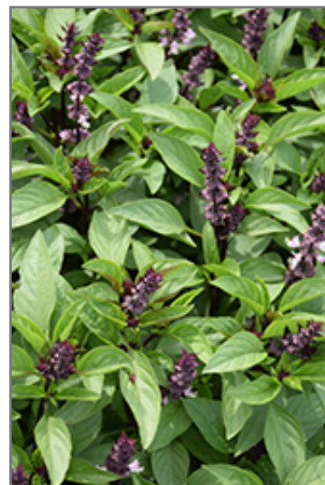
Sweet Basil flowers

Sweet Basil is a good choice for the edible garden, but it is also well-suited for use in outdoor pots and containers. It is often used as a 'filler' in the 'spiller-thriller-filler' container combination, providing the canvas against which the larger thriller plants stand out. Note that when growing plants in outdoor containers and baskets, they may require more frequent waterings than they would in the yard or garden.