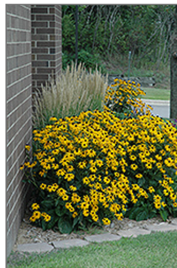
Goldsturm Coneflower in bloom