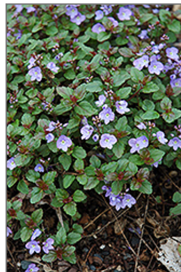
Waterperry Blue Speedwell in bloom