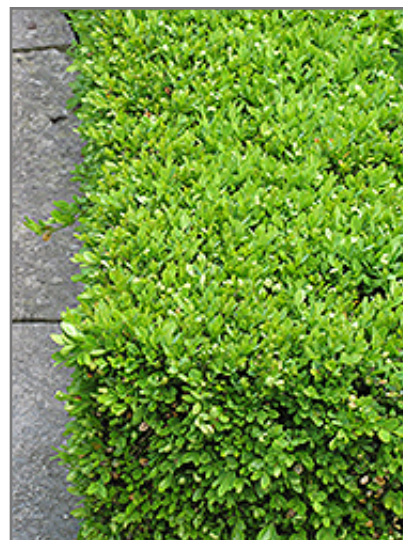
Green Velvet Boxwood foliage