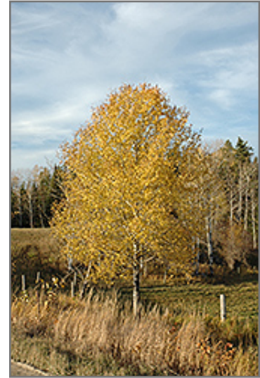
Trembling Aspen in fall

This tree should only be grown in full sunlight. It is an amazingly adaptable plant, tolerating both dry conditions and even some standing water. It is considered to be drought-tolerant, and thus makes an ideal choice for xeriscaping or the moisture-conserving landscape. It is not particular as to soil type or pH. It is quite intolerant of urban pollution, therefore inner city or urban streetside plantings are best avoided. This species is native to parts of North America.