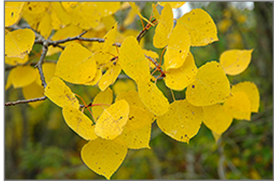
Trembling Aspen in fall

This tree should only be grown in full sunlight. It is an amazingly adaptable plant, tolerating both dry conditions and even some standing water. It is considered to be drought-tolerant, and thus makes an ideal choice for xeriscaping or the moisture-conserving landscape. It is not particular as to soil type or pH. It is quite intolerant of urban pollution, therefore inner city or urban streetside plantings are best avoided. This species is native to parts of North America.