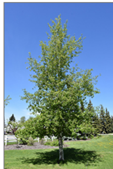
Trembling Aspen