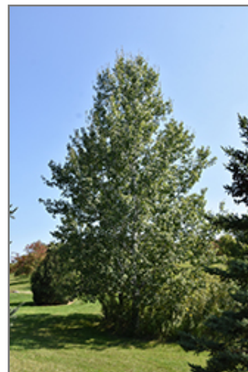
Trembling Aspen

Trembling Aspen is recommended for the following landscape applications;