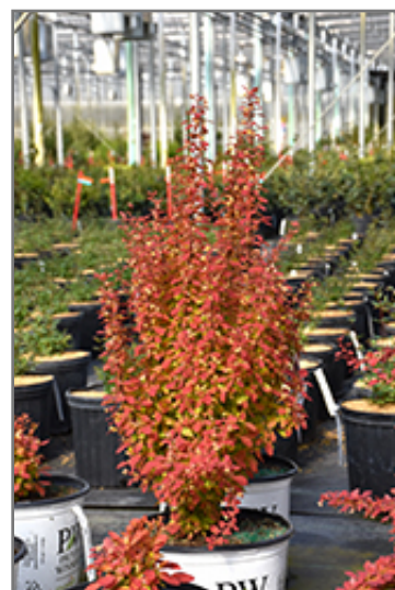
Sunjoy Orange Pillar Japanese Barberry