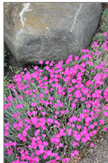
Firewitch Pinks in bloom

Firewitch Pinks is a fine choice for the garden, but it is also a good selection for planting in outdoor pots and containers. It is often used as a 'filler' in the 'spiller-thriller-filler' container combination, providing a mass of flowers and foliage against which the thriller plants stand out. Note that when growing plants in outdoor containers and baskets, they may require more frequent waterings than they would in the yard or garden.