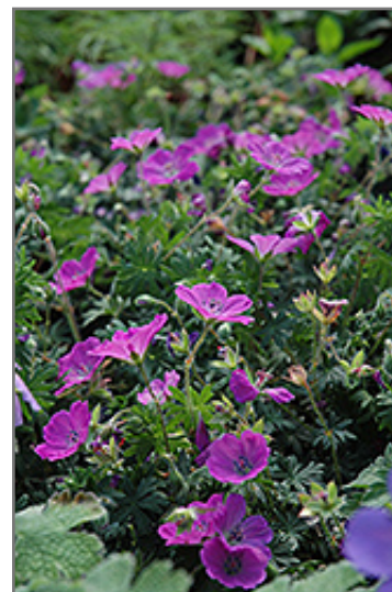
Max Frei Cranesbill flowers

This is a relatively low maintenance plant, and should only be pruned after flowering to avoid removing any of the current season's flowers. It is a good choice for attracting butterflies to your yard, but is not particularly attractive to deer who tend to leave it alone in favor of tastier treats. It has no significant negative characteristics.