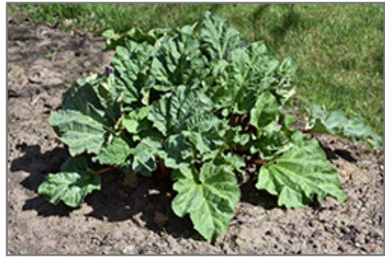
Chipman Red Rhubarb

Chipman Red Rhubarb features bold spikes of white flowers rising above the foliage from early to mid summer. Its enormous crinkled round leaves remain green in color throughout the season. The red stems are very colorful and add to the overall interest of the plant.