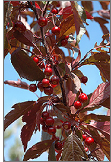
Royal Raindrops Flowering Crab fruit

This tree should only be grown in full sunlight. It prefers to grow in average to moist conditions, and shouldn't be allowed to dry out. It is not particular as to soil type or pH. It is highly tolerant of urban pollution and will even thrive in inner city environments. This particular variety is an interspecific hybrid.