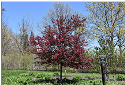
Royal Raindrops Flowering Crab in bloom

Royal Raindrops Flowering Crab is recommended for the following landscape applications;