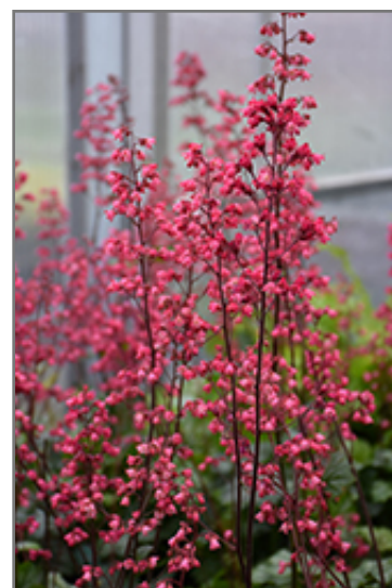
Paris Coral Bells flowers