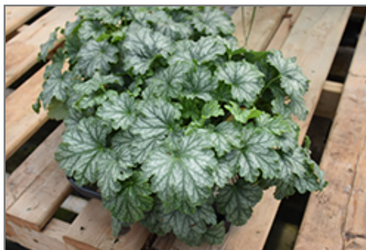
Paris Coral Bells foliage

Paris Coral Bells will grow to be about 8 inches tall at maturity extending to 14 inches tall with the flowers, with a spread of 14 inches. When grown in masses or used as a bedding plant, individual plants should be spaced approximately 12 inches apart. Its foliage tends to remain low and dense right to the ground. It grows at a medium rate, and under ideal conditions can be expected to live for approximately 10 years. As an evergreen perennial, this plant will typically keep its form and foliage year-round.