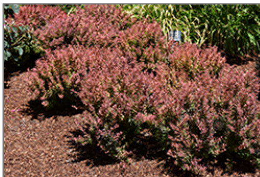
Golden Ruby Barberry

This shrub does best in full sun to partial shade. It is very adaptable to both dry and moist growing conditions, but will not tolerate any standing water. It is considered to be drought-tolerant, and thus makes an ideal choice for a low-water garden or xeriscape application. It is not particular as to soil type or pH, and is able to handle environmental salt. It is highly tolerant of urban pollution and will even thrive in inner city environments. This is a selected variety of a species not originally from North America.