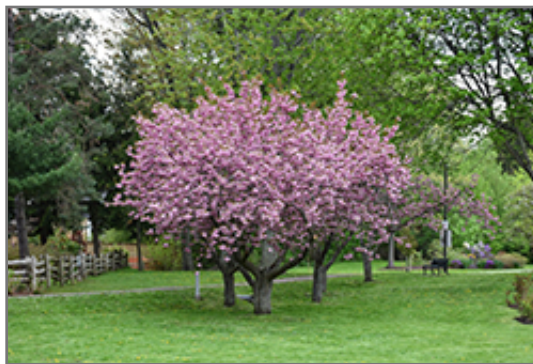
Kwanzan Flowering Cherry in bloom