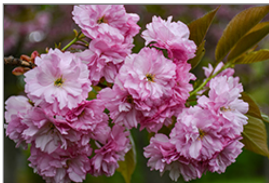
Kwanzan Flowering Cherry flowers

This tree should only be grown in full sunlight. It does best in average to evenly moist conditions, but will not tolerate standing water. It is not particular as to soil pH, but grows best in rich soils. It is highly tolerant of urban pollution and will even thrive in inner city environments, and will benefit from being planted in a relatively sheltered location. This is a selected variety of a species not originally from North America.