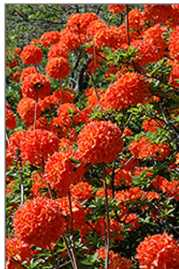
Mandarin Lights Azalea flowers