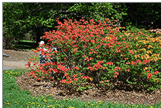
Mandarin Lights Azalea in bloom

This shrub does best in full sun to partial shade. You may want to keep it away from hot, dry locations that receive direct afternoon sun or which get reflected sunlight, such as against the south side of a white wall. It requires an evenly moist well-drained soil for optimal growth, but will die in standing water. It is very fussy about its soil conditions and must have rich, acidic soils to ensure success, and is subject to chlorosis (yellowing) of the foliage in alkaline soils. It is somewhat tolerant of urban pollution, and will benefit from being planted in a relatively sheltered location. Consider applying a thick mulch around the root zone in winter to protect it in exposed locations or colder microclimates. This particular variety is an interspecific hybrid.