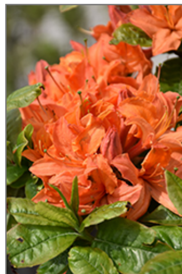
Mandarin Lights Azalea flowers