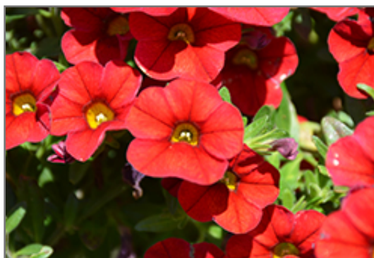
Superbells Red Calibrachoa flowers