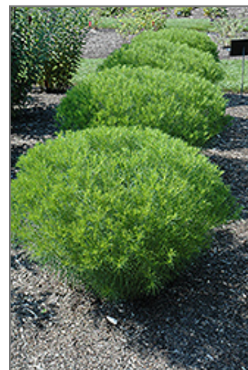
Narrowleaf Ironweed