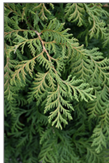
Soft Serve Falsecypress foliage