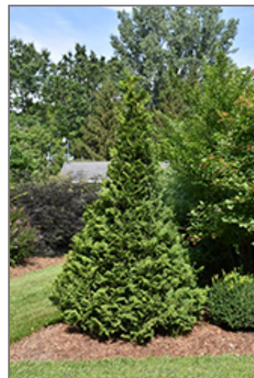
Soft Serve Falsecypress

Soft Serve Falsecypress is recommended for the following landscape applications;