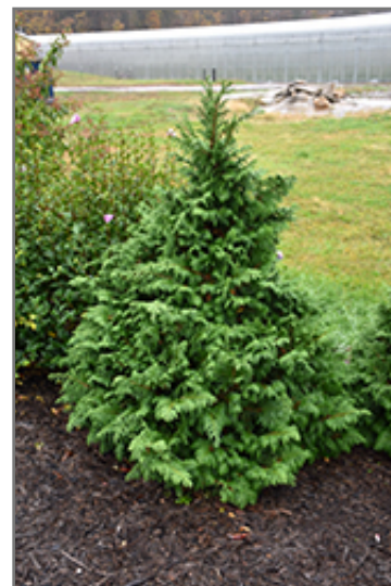
Soft Serve Falsecypress

This shrub does best in full sun to partial shade. It prefers to grow in average to moist conditions, and shouldn't be allowed to dry out. It is not particular as to soil type, but has a definite preference for acidic soils. It is highly tolerant of urban pollution and will even thrive in inner city environments. Consider applying a thick mulch around the root zone in winter to protect it in exposed locations or colder microclimates. This is a selected variety of a species not originally from North America.