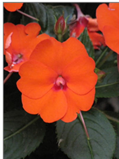
SunPatiens Compact Electric Orange New Guinea Impatiens flowers