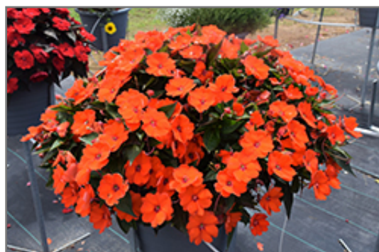
SunPatiens Compact Electric Orange New Guinea Impatiens in bloom

This plant will require occasional maintenance and upkeep, and should not require much pruning, except when necessary, such as to remove dieback. It is a good choice for attracting bees and butterflies to your yard. It has no significant negative characteristics.