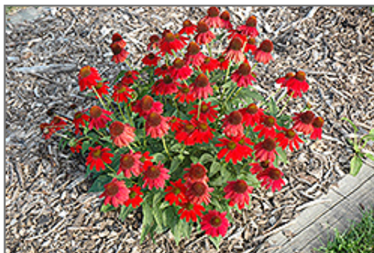
Sombrero Salsa Red Coneflower in bloom

Sombrero Salsa Red Coneflower will grow to be about 16 inches tall at maturity extending to 24 inches tall with the flowers, with a spread of 24 inches. Its foliage tends to remain dense right to the ground, not requiring facer plants in front. It grows at a medium rate, and under ideal conditions can be expected to live for approximately 10 years. As an herbaceous perennial, this plant will usually die back to the crown each winter, and will regrow from the base each spring. Be careful not to disturb the crown in late winter when it may not be readily seen!