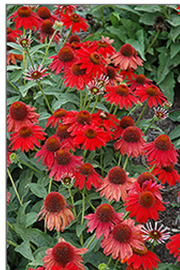
Sombbrero Salsa Red Coneflower flowers