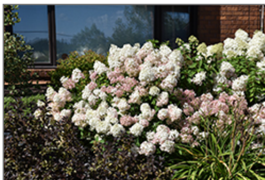
Bobo Hydrangea in bloom