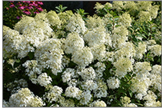
Bobo Hydrangea flowers