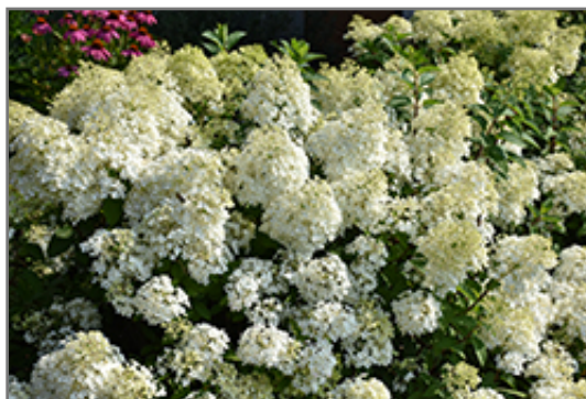
Bobo Hydrangea flowers